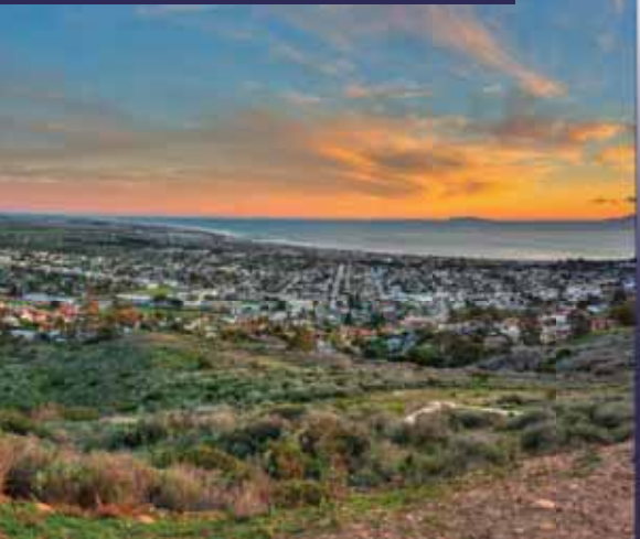
CELEBRATING 50 YEARS of Closing Loans and Opening Doors