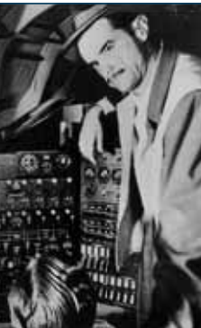
Photo: Howard Hughes Est. 1940 as Hughes Aircraft Employees Federal Credit Union

Our history is rooted in success – Dedicated to helping our members achieve their dreams.