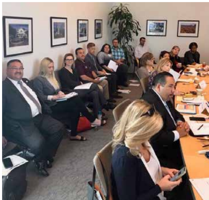
Participants attend VCCAR Board meeting.