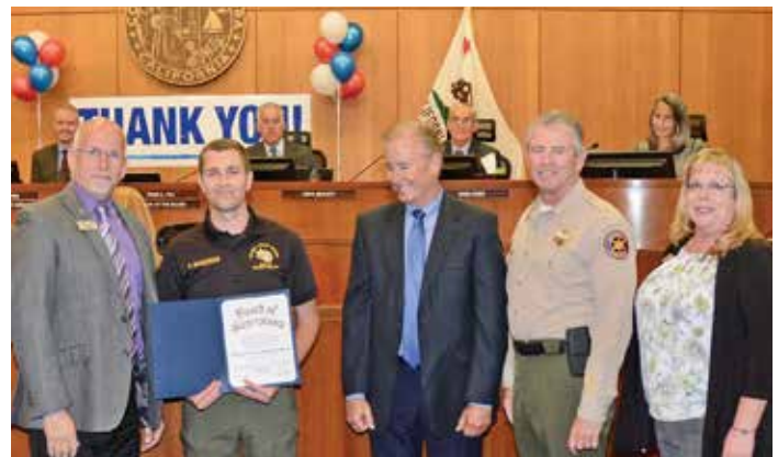
VCCAR was recognized at a recent meeting of the Ventura County Board of Supervisors for its disaster relief efforts.

The $500,000 from NAR's Realtor's Relief Foundation is designed to provide housing-related assistance to victims of disasters – homeowners and renters alike – but applications must be reviewed by NAR staff before checks can be cut. Most of the allocations that will be paid out from NAR funds are still being processed but the local and national AORs are working hard to get the money distributed as quickly as possible. 🌍